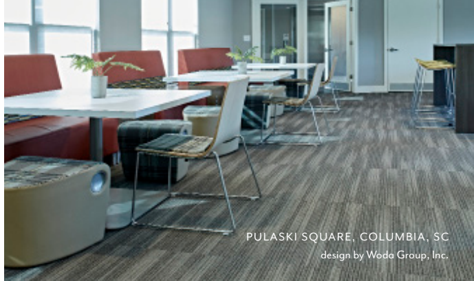
PULASKI SQUARE, COLUMBIA, SC design by Woda Group, Inc.

IN THE US, HOUSEHOLD SIZES ARE SHRINKING. A NEW POOL OF DIVERSE RENTERS WITH A VARIETY OF WANTS AND NEEDS ARE EMERGING AND OCCUPYING MULTI-FAMILY HOUSING.