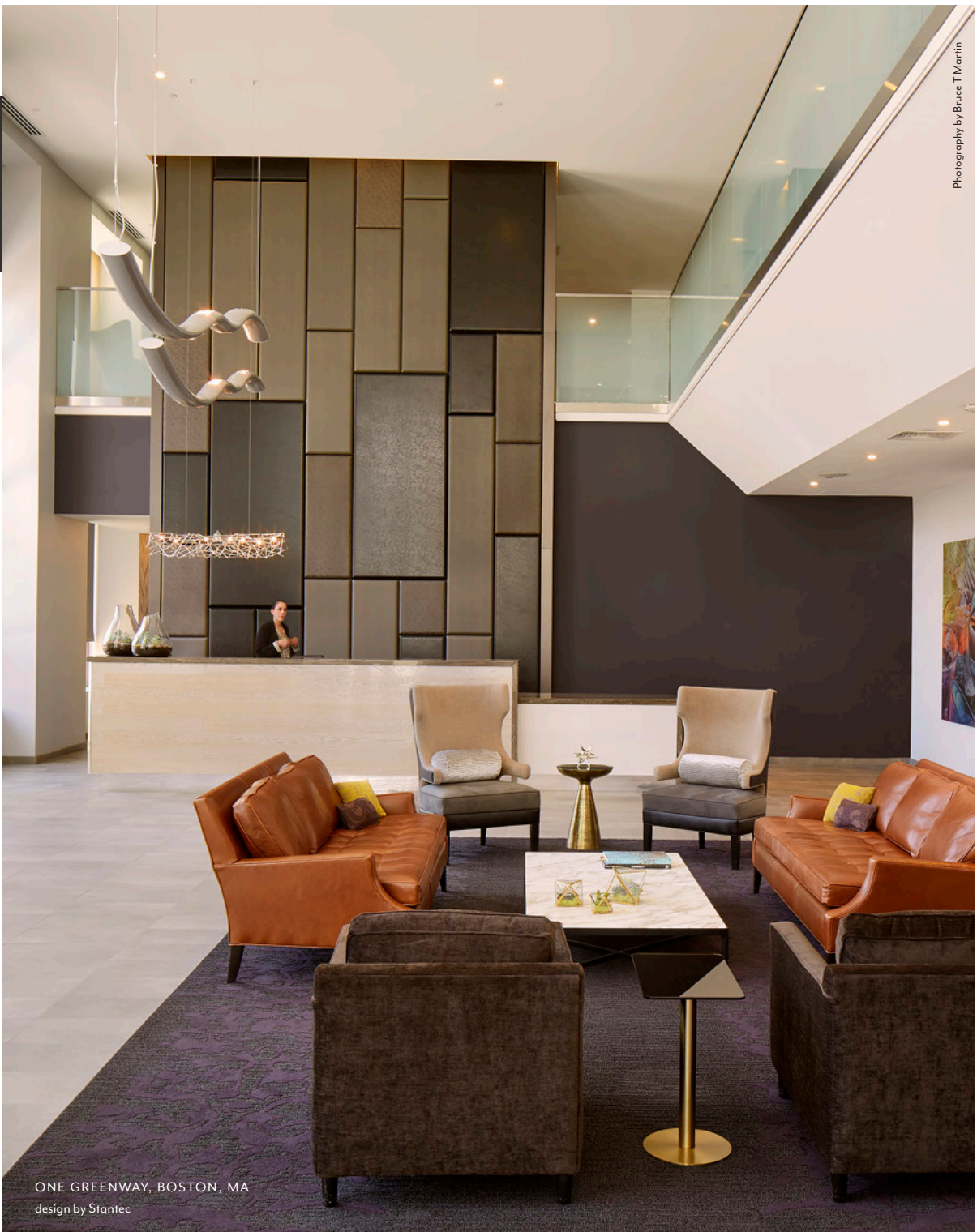
ONE GREENWAY, BOSTON, MA design by Stantec